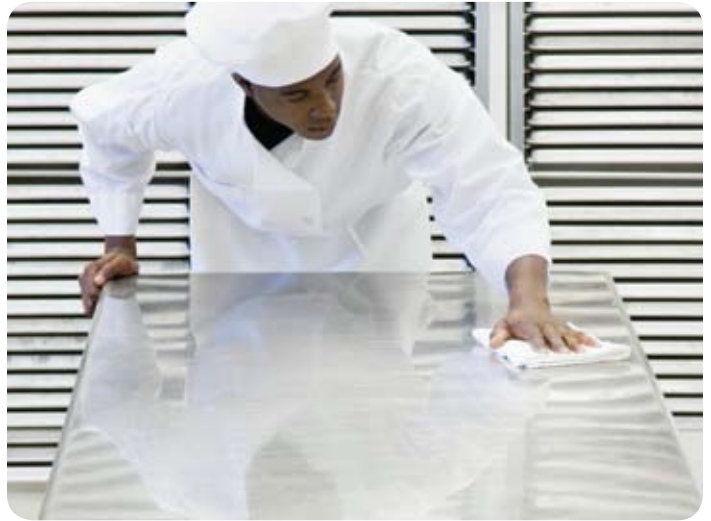
May be used in food preparation areas as directed.